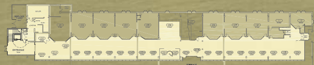
Floor plan showing retail locations